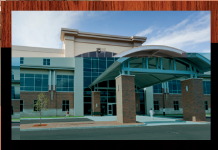
STATE OF THE ART: UHS expanded access to quality care in the Southern Tier during 2012 with the opening of UHS Vestal, a compelling example of architectural, artistic and clinical excellence in New York's Southern Tier.