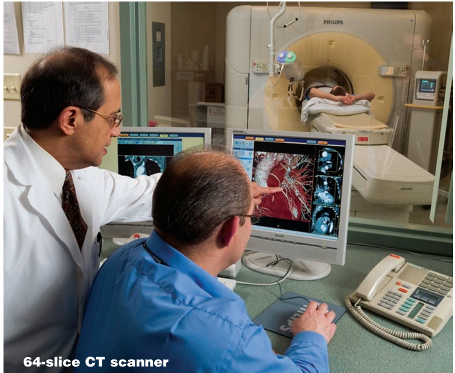
64-slice CT scanner