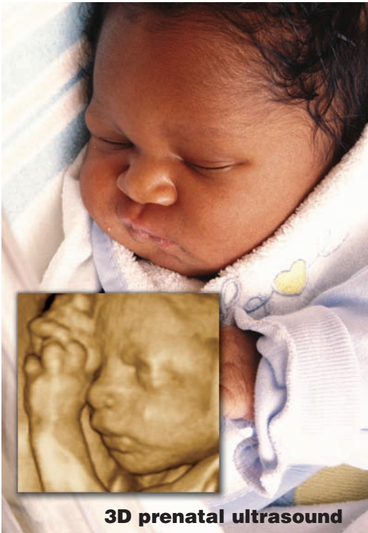
3D prenatal ultrasound